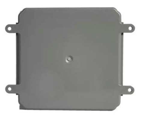
Back side - with mounting tabs.

Specifications: 6.25" (159 mm) W x 6.25" (159 mm) D x 4.375" (112 mm) H * 5.7 lbs (2.6 kg)